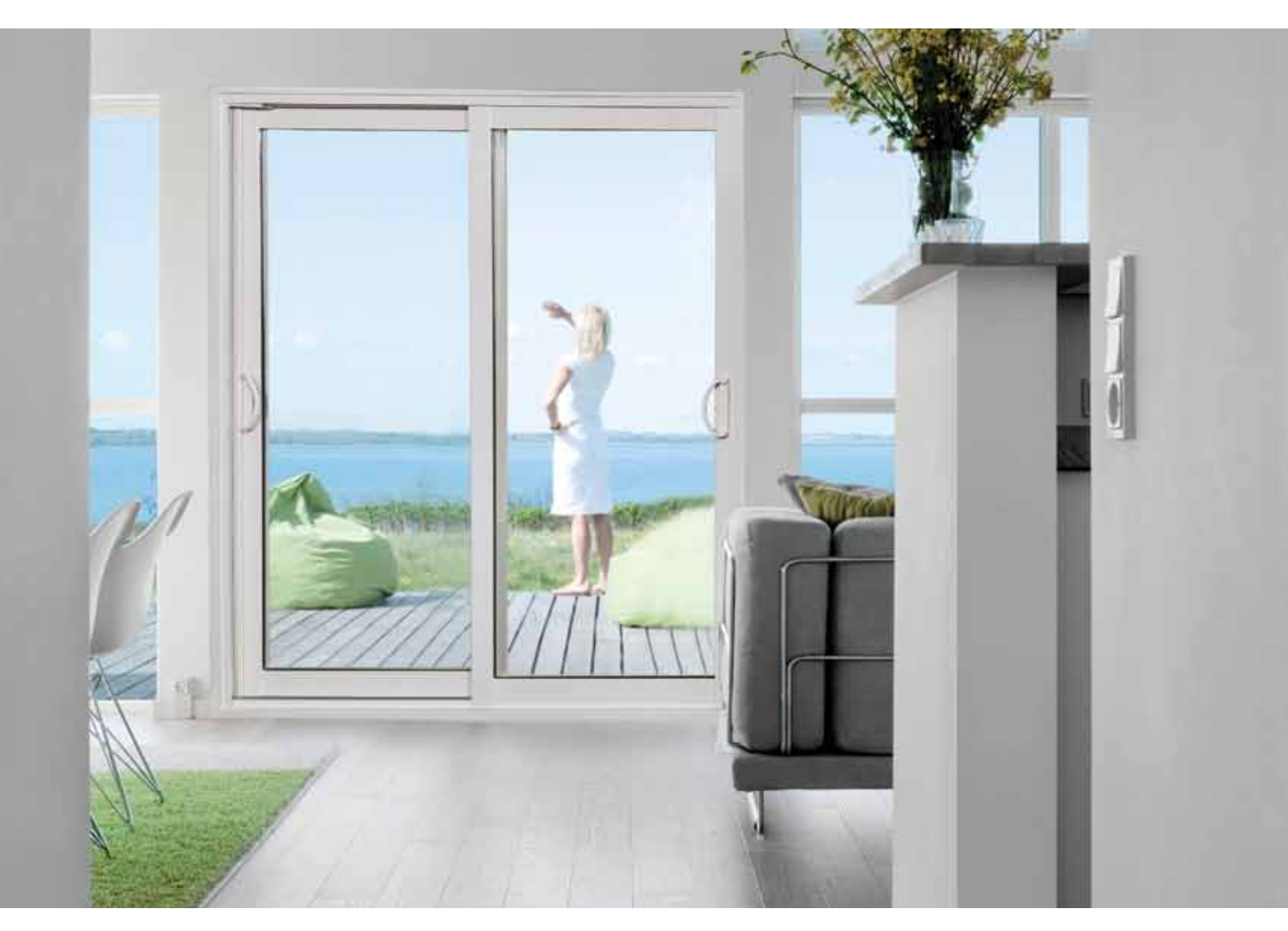
Double Slider (XX)